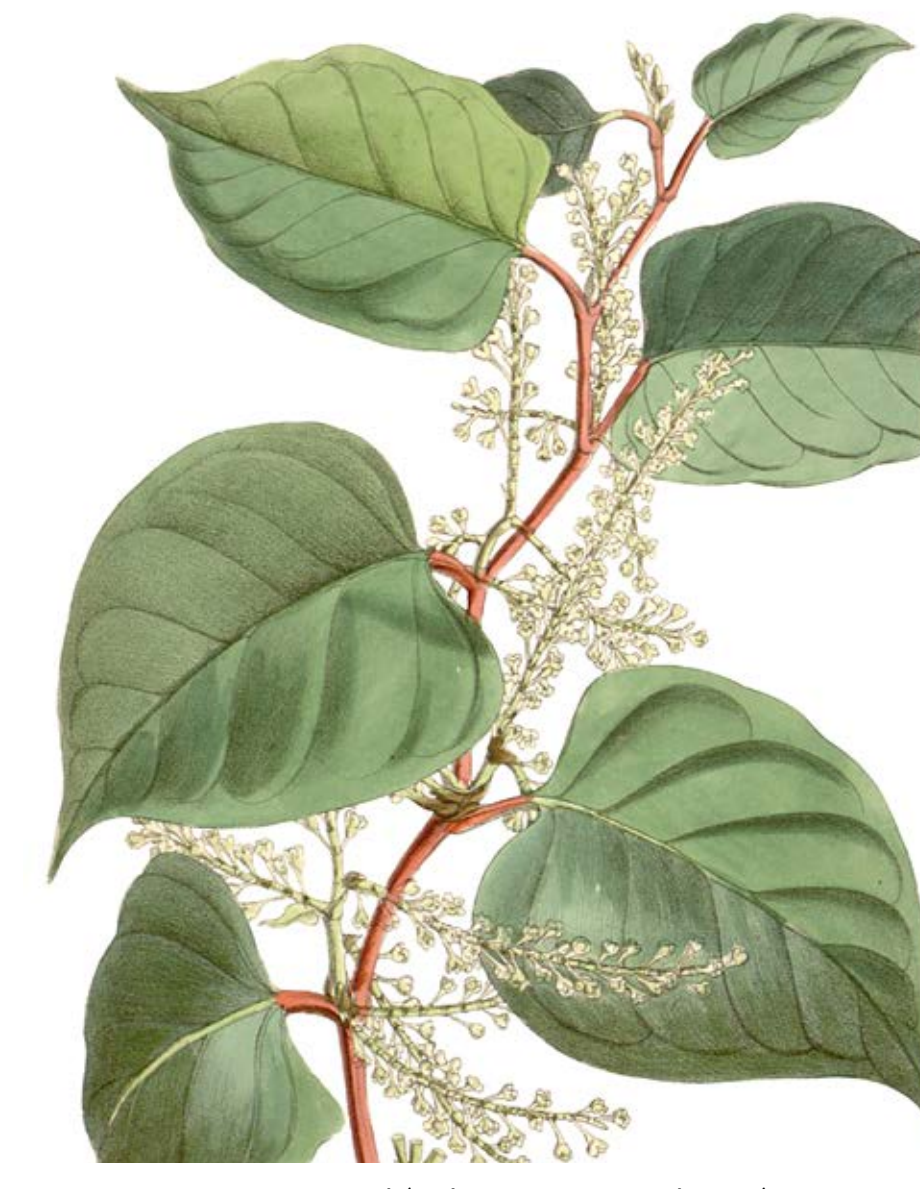
Japanese Knotweed (Polygonum Cuspidatum).

In addition, there are two forms of Resveratrol: Transand Cis-isomer. Trans-form is a biologically active. This isomer is used in Swiss Energy products.