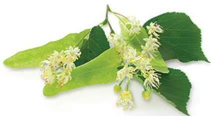
Linden flowers (Tilia sp.)

The healing properties of lime are linked with tiliacin, hesperidin, quercetin and kaempferol. These substances have an antibacterial effect. Also, linden has a strong antipyretic effect. It's healthful for colds, cough, sore throat.