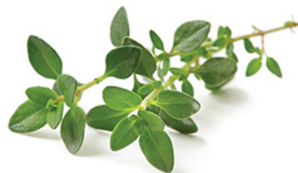
Thyme (Thymus vulgaris L.)

Soothes cough and has an antispasmodic effect. It's good for all types of cough, inflammation of the upper respiratory tract and bronchitis.