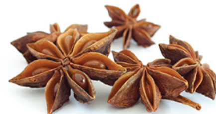
Staranise (Illicium verum Hook. F.)

It's rich in various essential oils that have a beneficial effect on breathing. Effective in case of coughing and contributes to the dilution of bronchial secretions.