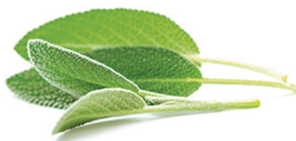
Sage (Salvia officinalis L.)

Contains a large amount of essential oils (up to 3%), flavonoids, tannins. It has a pronounced anti-inflammatory, antibacterial action. Highly effective in case of coughing, as well as for inflammation and sore throat.